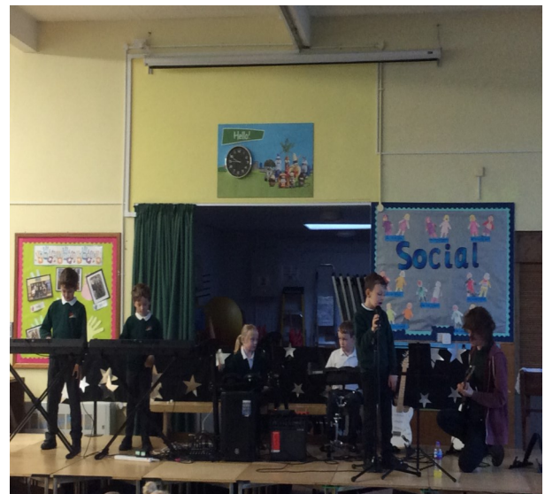
Some of the fabulous children from this mornings Rock Steady concert.