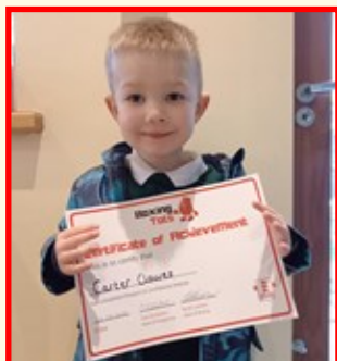
Carter was awarded 2 certificates at boxing.