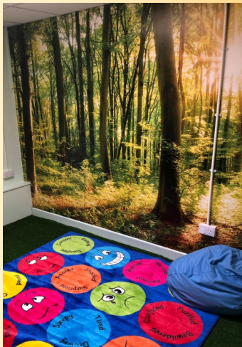
Nurture room at Reginald Mitchell