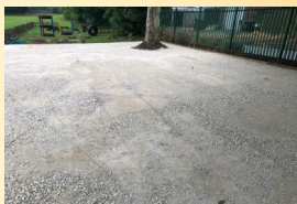
Groundwork completed ready for the installation of an outdoor classroom over the summer at Reginald Mitchell.