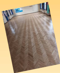
Hall floor refurbished at Knypersley – ready for the next Strictly come Dancing comp!