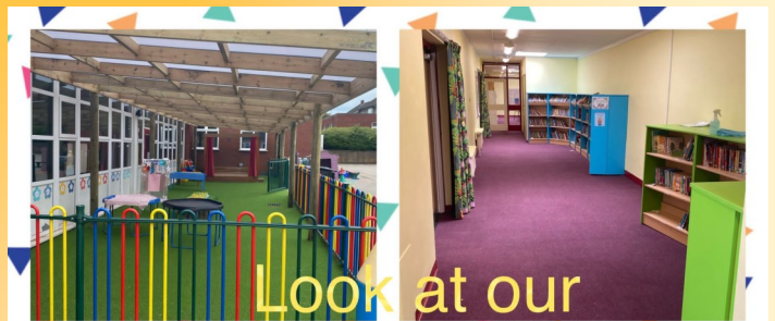
Look at our