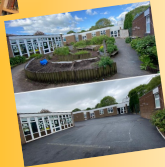
Quad refurb with carpark work to be completed over the holidays