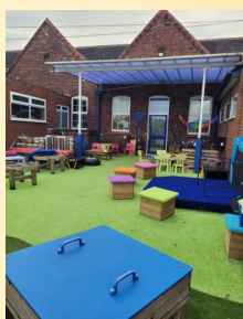
EYFS Outdoor area at Kingsfield. Full staffroom refurbishment currently underway!